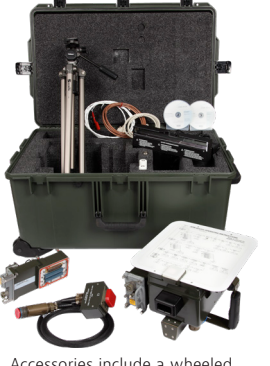
Accessories include a wheeled transit case (standard) and tripod (optional).

For complete certification list see APM-424(V)5 Specification Sheet